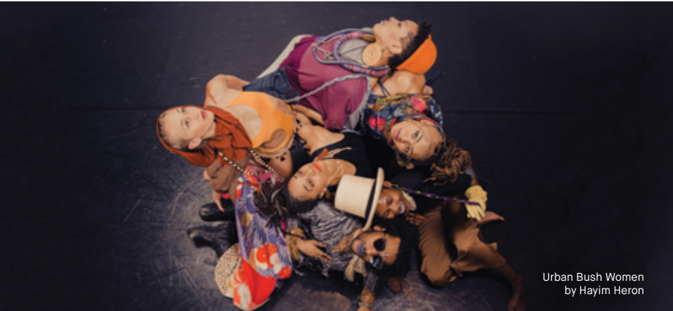
Urban Bush Women